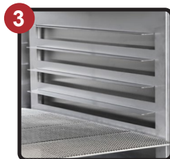
Fixed Rack Holds Donut Screens