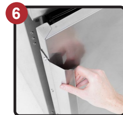
Magnetic Work Flow Door Handle