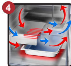
Removable Humidity Pan