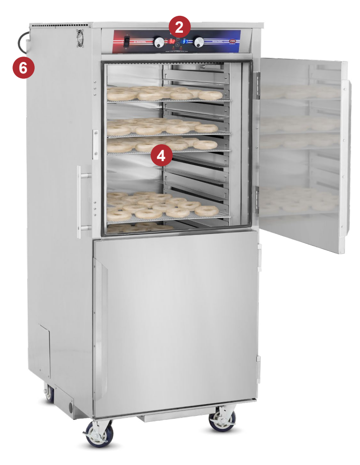
(Shown with Optional Accessories Auto Water Fill, Push-Pull Handles, and Stainless Steel Removable Tray Slides)