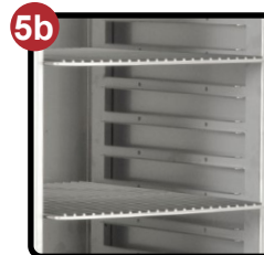
GN Fixed Rack