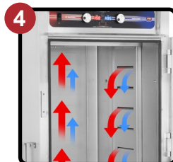
Push-Pull Air Distribution