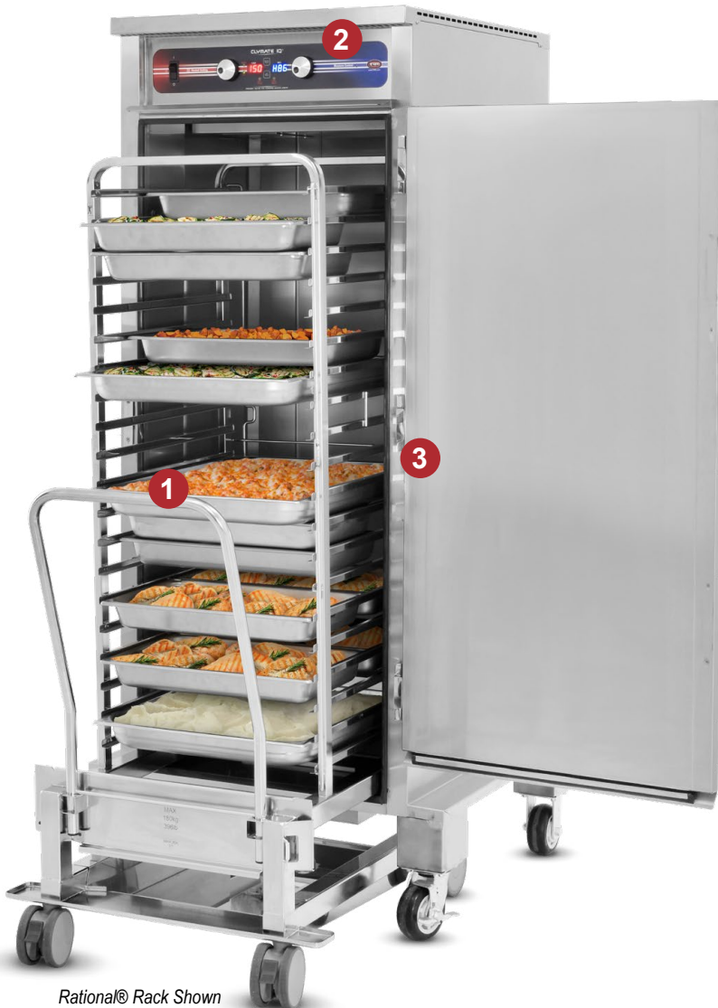
Rational® Rack Shown (Not Included)