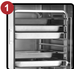
For Full Size Combi Rack