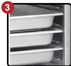
Convenient Fixed Rack Assembly