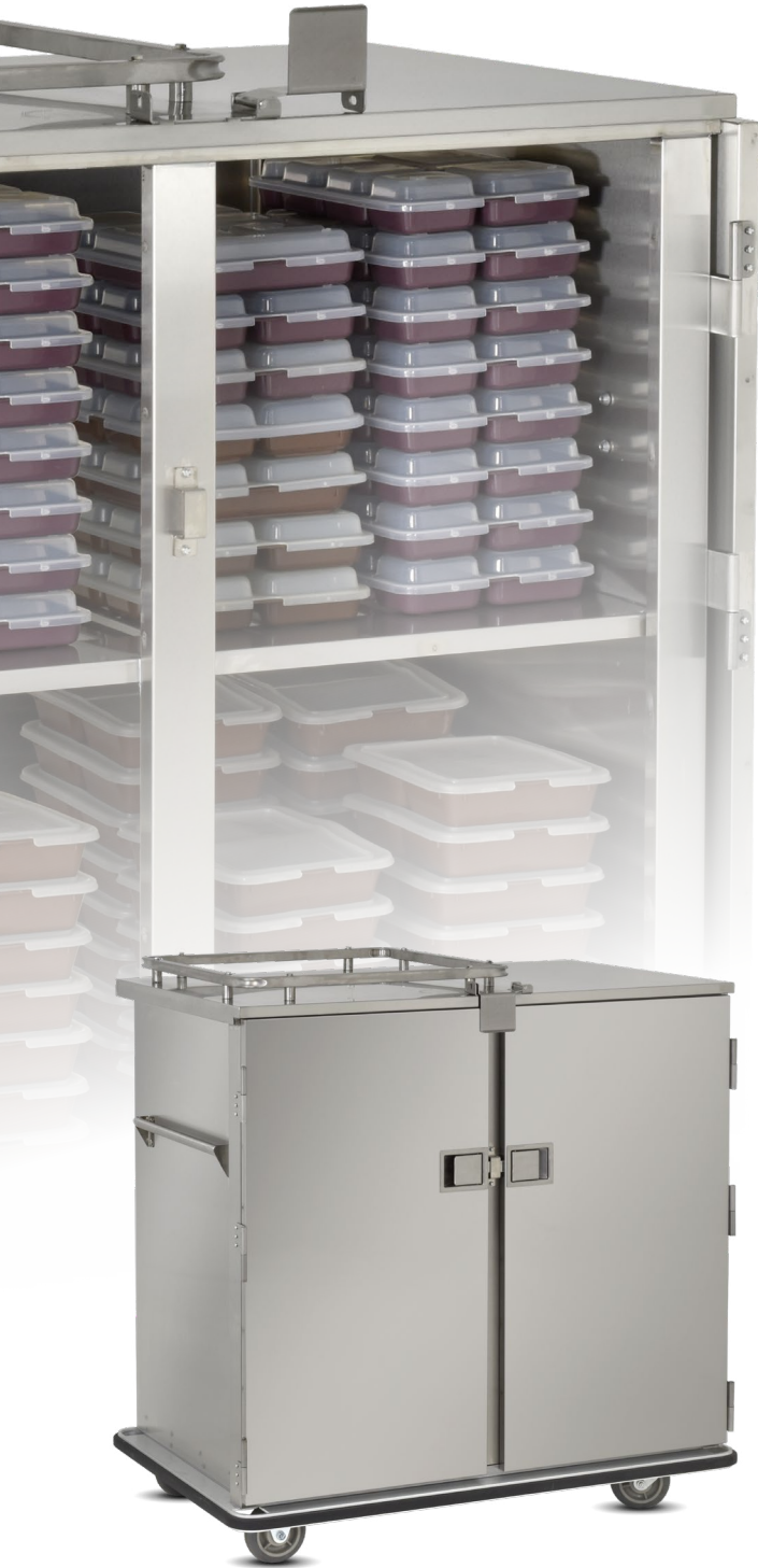
ETC-1520-32 HDM Level 2 (Shown with Optional Top Guard Rail)

HDM (Heavy Duty Modified) equipment is ideal for schools, institutions and correctional facilities.