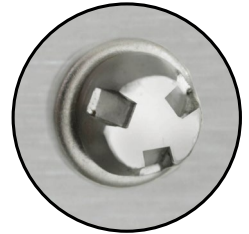
TAMPER-PROOF FASTENERS (OUTSIDE ONLY)