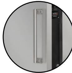
TUBULAR STAINLESS STEEL HANDLES