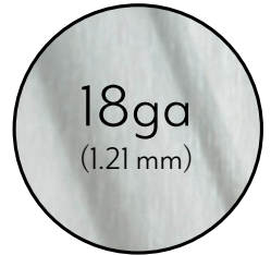
18 GAUGE STAINLESS STEEL EXTERIOR